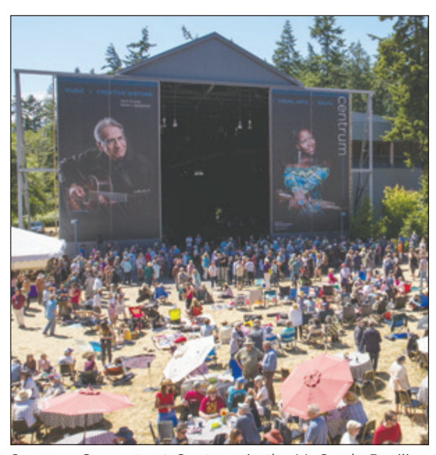
Summer Concerts at Centrum in the McCurdy Pavilion